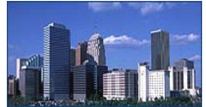
Downtown Oklahoma City

upcoming Mid-Year Meeting in Oklahoma City. As always, please feel free to contact me should there be any legal questions that may arise that could impact NAPIA or the public adjusting profession.