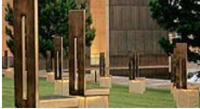
Oklahoma City National Memorial

similar number of CEUs have been submitted to state insurance departments requiring continuing education for public adjusters.