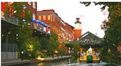
Water taxis abound in Bricktown