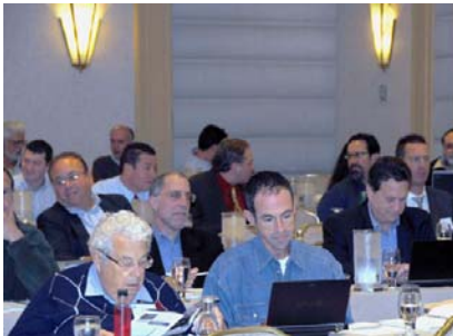
PAs take notes during seminar