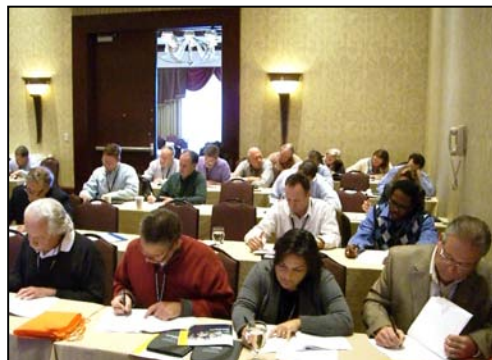
One of twenty FPCC breakout sessions

conference materials on USB drives for all. Attendees were also impressed with the variety and number of exhibitors on hand, with one saying “It’s great to have a resource for vendors that work with the public adjusting industry. With regard to how participants felt