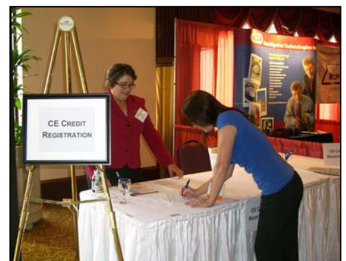
FPCC attendees received twelve CE credits for two full days of seminars

The third First Party Claims Conference will take place October 17-19, 2011 at the Crowne Plaza Hotel in Warwick, RI. Details will be posted soon on www.firstpartyclaims.com .