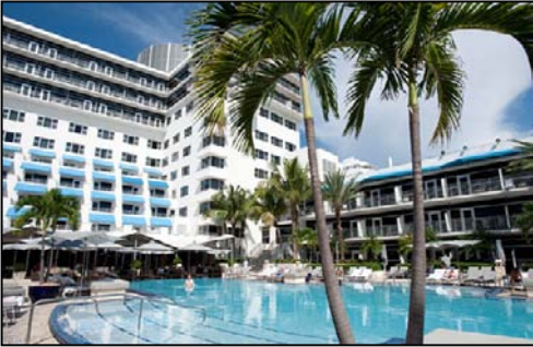
The Ritz-Carlton South Beach